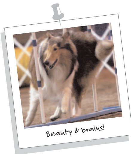
Beauty & brains!

The intelligence and sensitivity of the Collie, as well as the spectacular beauty of both varieties, Rough and Smooth, have been leading factors in the breed's success as a family dog for a very long time. The Collie's legendary character has been immortalized in the cherished books of our childhood: Eric Knight's Lassie Come Home and Albert Payson Terhune's Lad: A Dog, Gray Dawn , and many others. Through the brilliant use of personification, both authors brought to life the important aspects of Collie character—qualities such as loyalty, devotion, courage and dignity. These novels helped to popu-