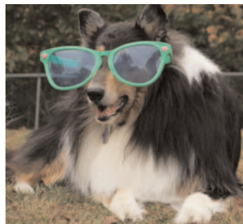
A great sense of humor!